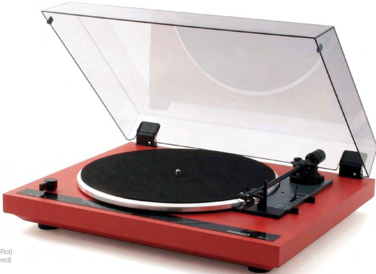
TD 170-1 (Thorens Rot) TD 170-1 (Thorens red)

d: Nicht nur für Einsteiger. Der hochwertig verarbeitete Vollautomat TD 170-1 verfügt über drei verschiedene Drehzahlen, so dass er auch alte Schellackplatten mit 78 Umdrehungen pro Minute wiedergeben kann (hierzu wird eine spezielle Nadel benötigt, die separat erhältlich ist). Dank der kinderleichten Bedienung können Sie mit diesem Plattenspieler sofort loslegen, ganz ohne zeitraubende Justagearbeit. So macht analoge Musik Spaß!