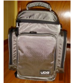
Ultimate DJ Gear Producer Bag www.Ultimate-DJ-Gear.com

A DJ is always on the go - in the club, on the plane, in the studio, and on the road, and they need gear to support an active lifestyle. Just like fashionistas who swear that the right handbag makes an outfit, the right DJ bag can make or break a DJ. With this in mind, I tested the Producer bag from Ultimate DJ Gear (UDG).