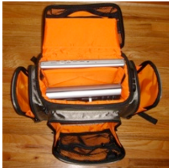
Ultimate DJ Gear Producer Bag - Side and Front Pockets Open www.Ultimate-DJ-Gear.com

The Producer bag itself is quite impressive. Measuring (in inches) 10.5 X 7.5 X 19, it was clearly designed for a traveling DJ - as that is easily below the size restriction for airline carry-ons (which range from 22 x 14 x 9 to 24 X 16 X 10, depending on the airline.)